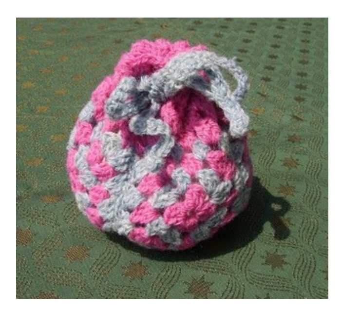
and yet another one using fine crochet cotton.