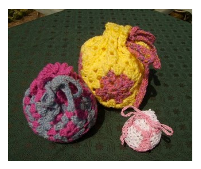
Jolly Little Goody Bags © Janet McMahon, 2010.

Thread the drawstring through the chain spaces on the second row from the top. Fill your bag with goodies and give it to someone you love.